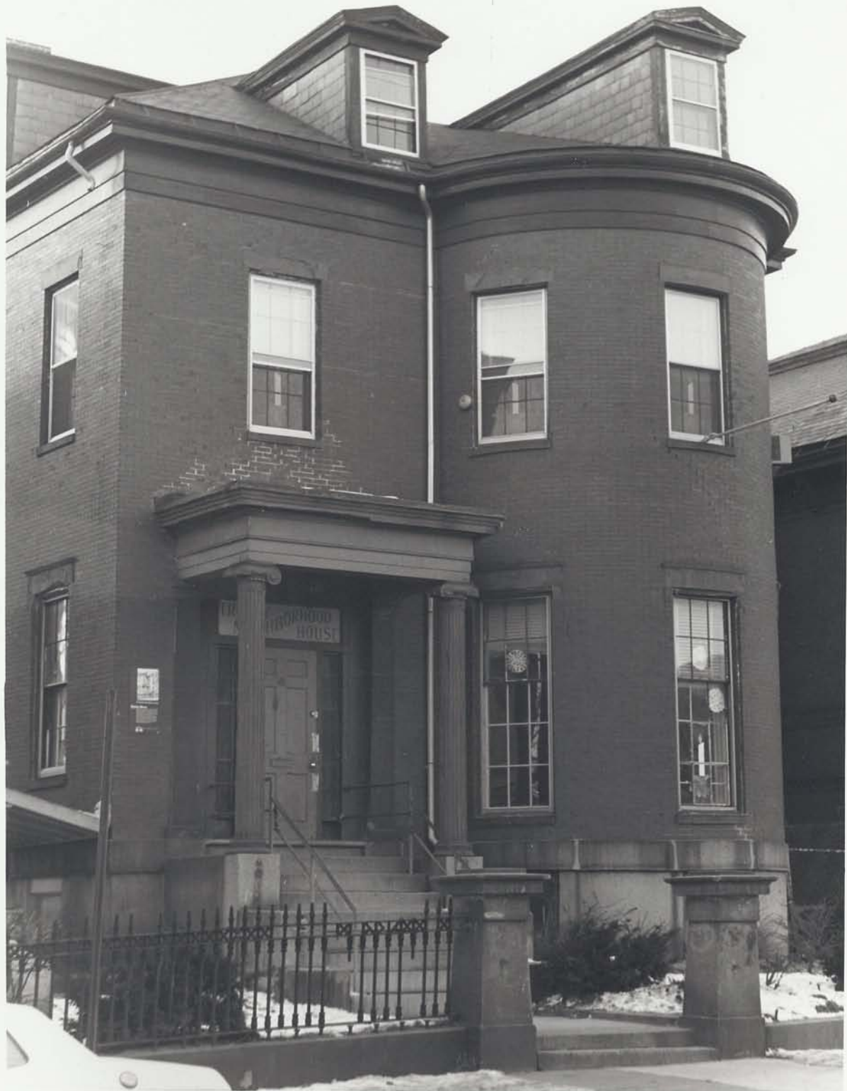
TRINITY NEIGHBORHOOD HOUSE 406 Meridian Street East Boston Front (east) facade