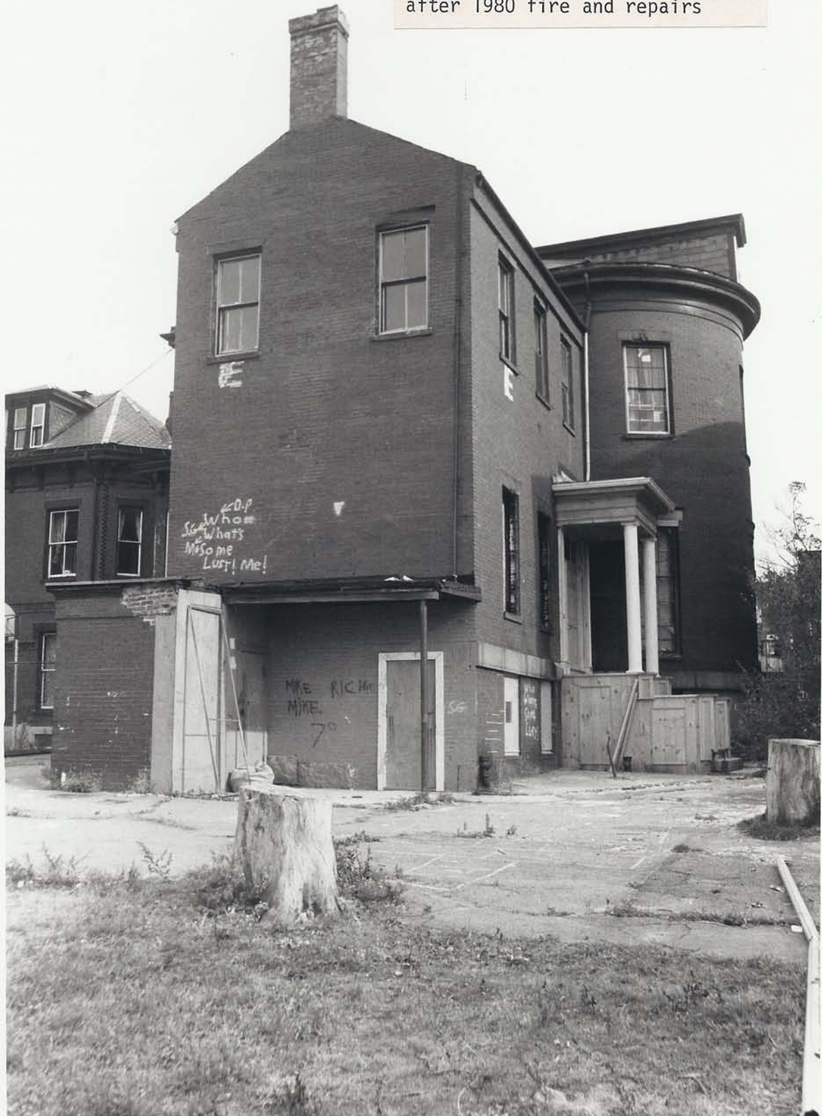
TRINITY NEIGHBORHOOD HOUSE 406 Meridian Street East Boston Rear wing (west & south elevation) after 1980 fire and repairs