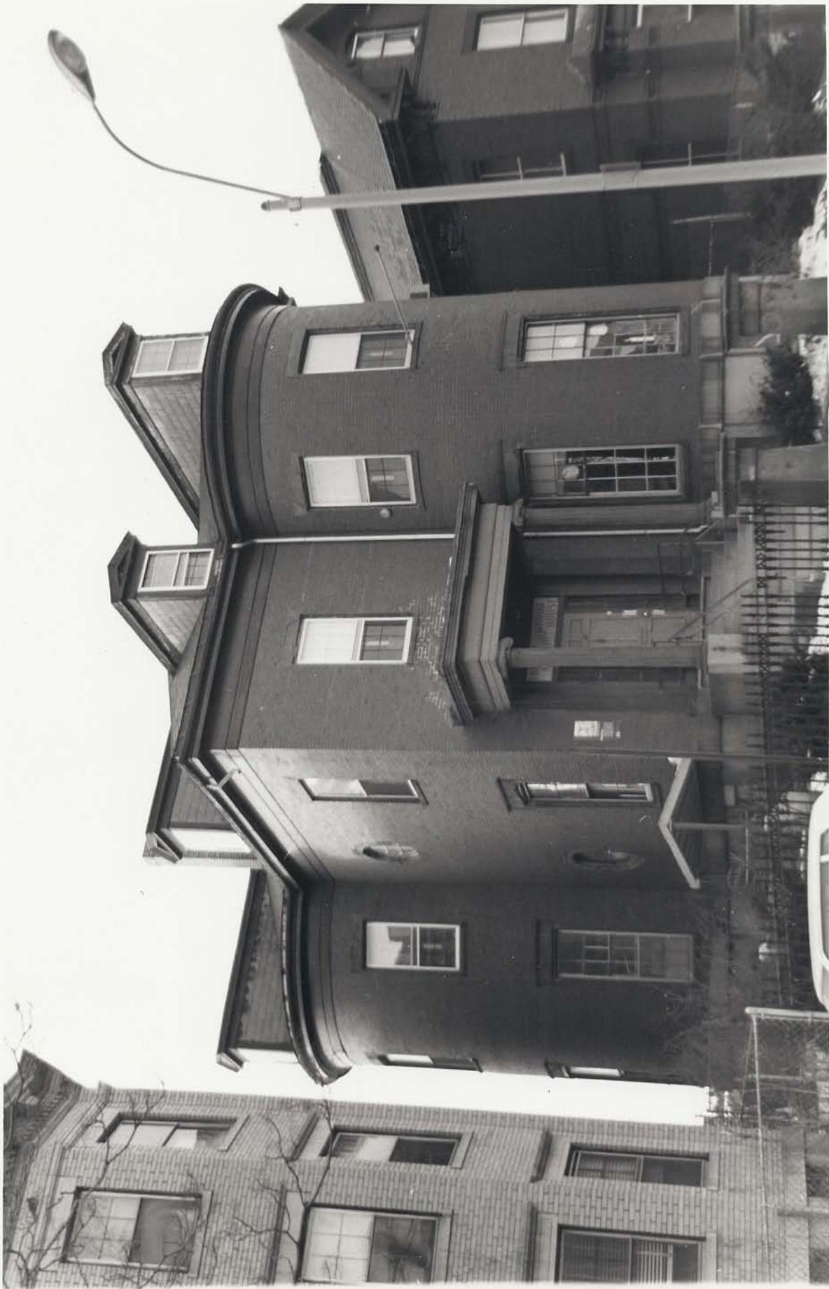
TRINITY NEIGHBORHOOD HOUSE 406 Meridian Street East Boston East (front) facade and part of south elevation